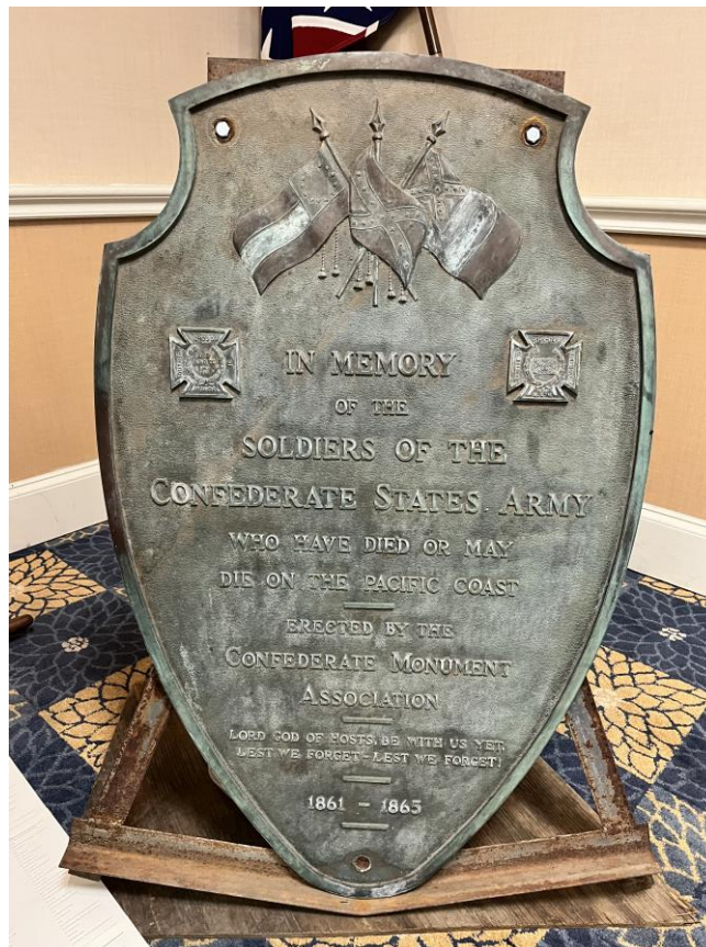
Plaque from UDC boulder monument (est. June 6 th , 1925), in Hollywood Forever Cemetery

No period attire • No uniforms • No flags