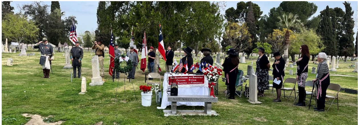
SCV Color Guard & CA Division UDC Ladies at Union Cemetery